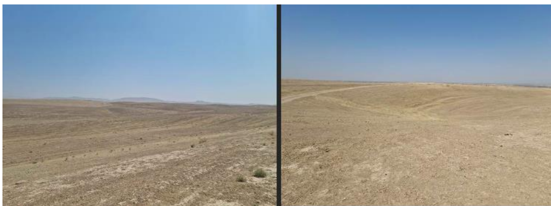
Figure 3: Guzar Site Picture