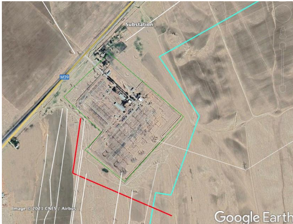
Figure 4: Proposed Transmission Line Route 11 (approximately 1.5 km length)